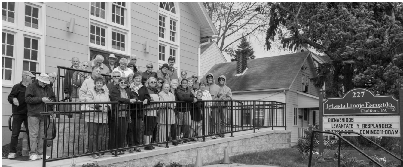
Visiting the original church location on Main Street in Chalfont now occupied by a Spanish congregation.