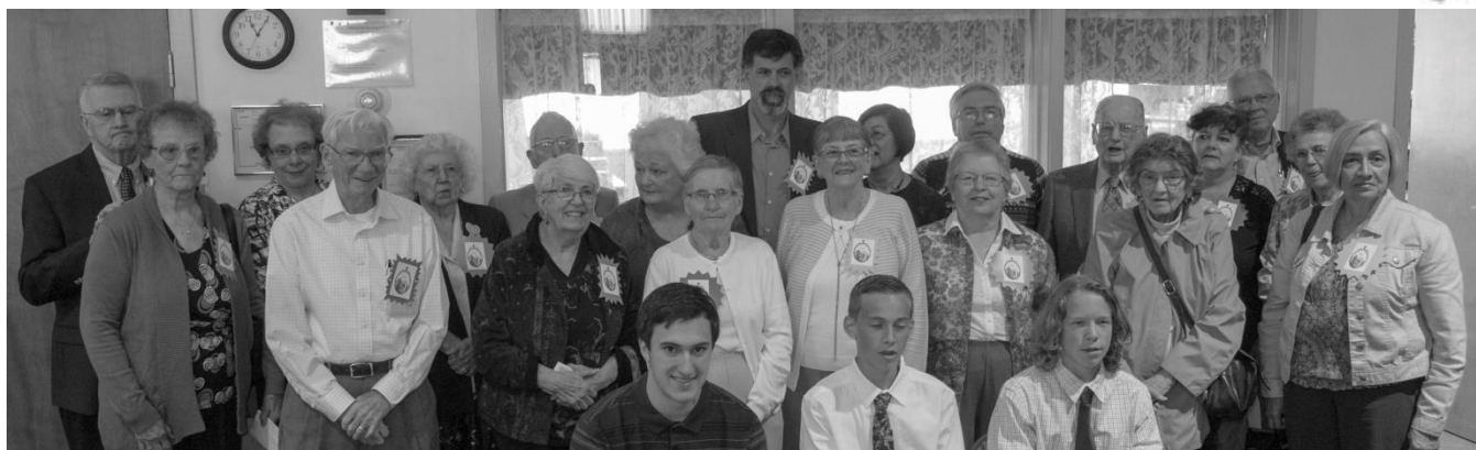
40+ years of membership & new members from confirmation class.